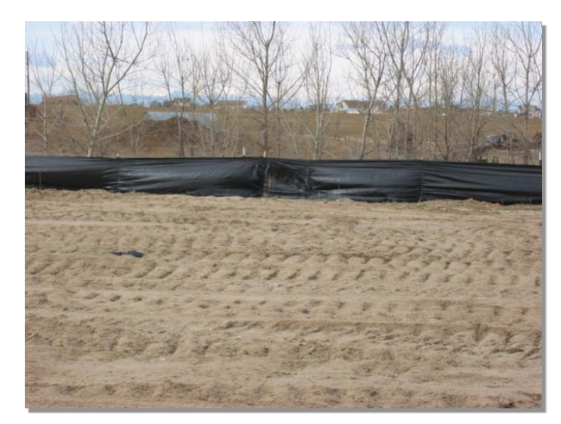
Photograph SF-1. Silt fence creates a sediment barrier, forcing sheet flow runoff to evaporate or infiltrate.

• At the perimeter of a construction site.