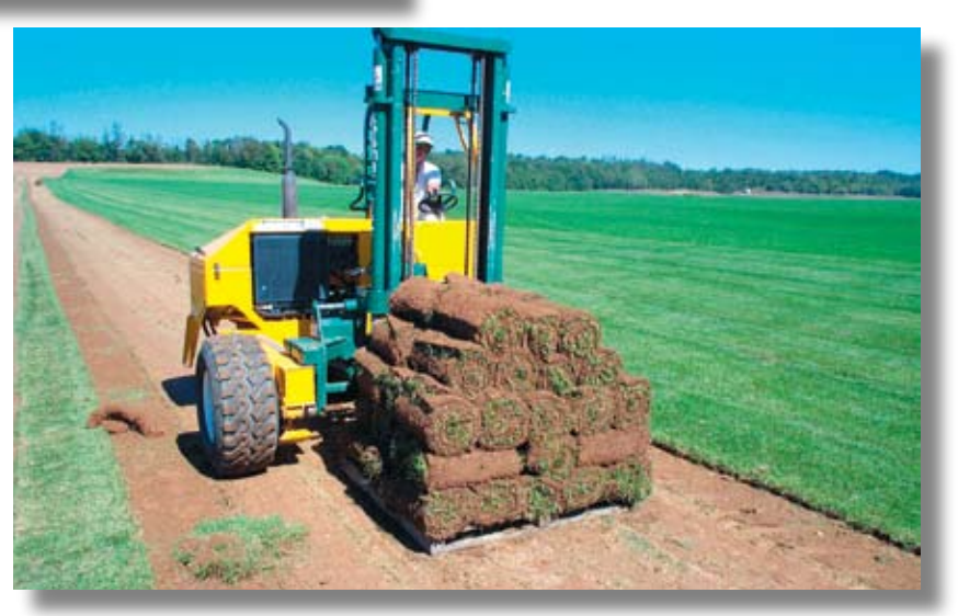
Rolled sod should be moist, flexible, green, and fresh. For best results, install as soon as possible after final grade is established.

Use sod in ditches and around drop inlets for superior protection against scouring flows. Sod slows down concentrated flows and promotes filtration and settling of sediment-laden runoff.