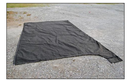
Carthage Mills 4243 Hunt Road Cincinnati, OH 45242 www.carthagemills.com

The FBX<sup>™</sup>-80 is Carthage Mills' standard filter bag, and is manufactured with a sturdy 8 oz/yd<sup>2</sup> nonwoven polypropylene geotextile; however, FBX Filter Bags can also be made using a wide variety of geotextiles depending on overall size requirements, the type of sediment being pumped, and other site-specific or Engineering