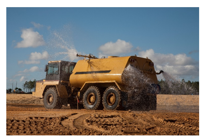
A truck equipped with a spray system can spray water throughout a construction site and prevent dust from being transported off-site.

The quantity of dust generation and transport depends on the amount of exposed soil. Therefore, when designing a dust control plan, design engineers and construction staff can greatly reduce dust generation by sequencing activities in a way that disturbs only small