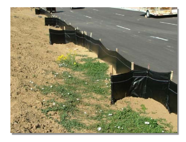
Photograph SF-2. When silt fence is not installed along the contour, a "J-hook" installation may be appropriate to ensure that the BMP does not create concentrated flow parallel to the silt fence.

Silt fence may be removed when the upstream area has reached final stabilization.