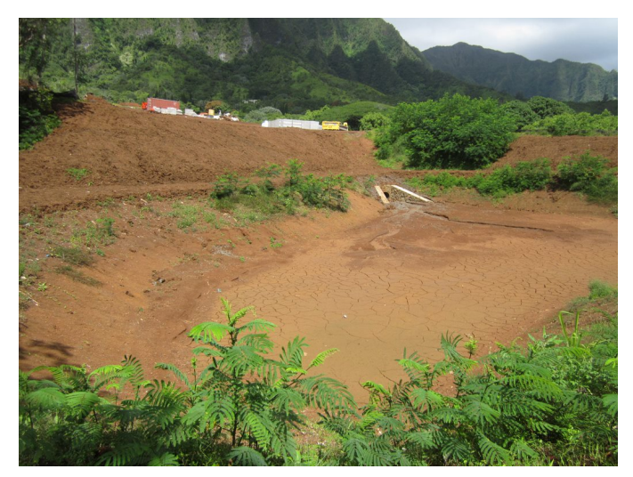
A large sediment basin with partially stabilized embankments.

consists of two parts: dry storage (volume of storage below the riser height) and wet storage (volume of storage above the riser). Side slopes should be no steeper than 2 feet horizontally for every 1 foot of elevation change inside the structure and 3 feet horizontally for every 1 foot of elevation change on the outlet side.