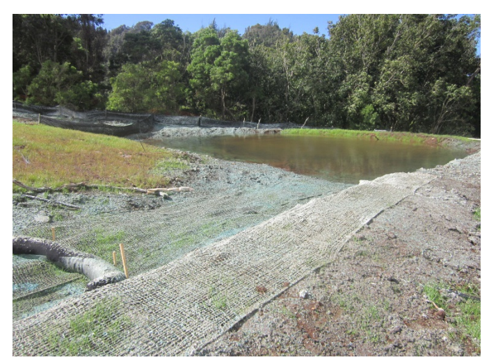
A sediment basin with earthen embankments stabilized with erosion matting and hydroseed.

The choice to construct a sediment basin with an earthen embankment or a rock dam depends on the materials available, the location of the basin, and the