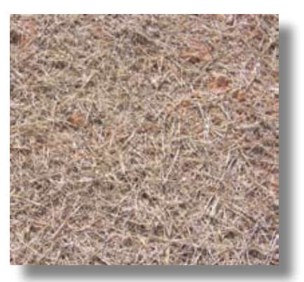
Visually inspect mulched areas to ensure uniform, sufficient coverage. Application must cover all bare areas, with less than 5 percent soil showing through mulch cover.

Good use of straw mulch and grass seed in relatively flat and fairly wide swale. For more concentrated flows, triple seed the ditch and use erosion control blankets.