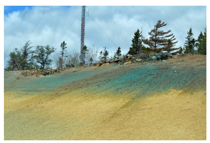
Straw and hydroseed applied to a slope.

Mulch is applicable to most construction sites and can provide immediate, inexpensive erosion control. Sites often use mulch with seeding to help establish vegetation and stabilize soils, and mulch can be effective in areas where it is difficult to establish vegetation, such as areas with steep slopes. Mulches are also effective in areas where sensitive seedlings need moisture retention